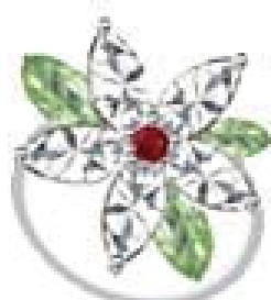
Ring for Women