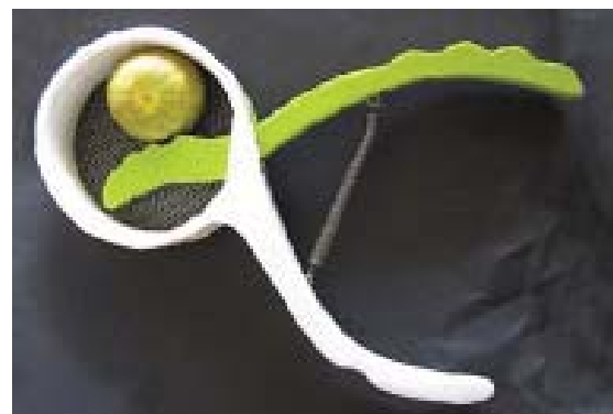
Third Prize Winner Design