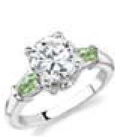
Ring for Men